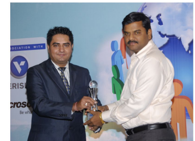
Partner of the Year Award from NET 4 for 2011