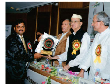
Won Award for Outstanding Contributions to National Development in Software Industry 2011